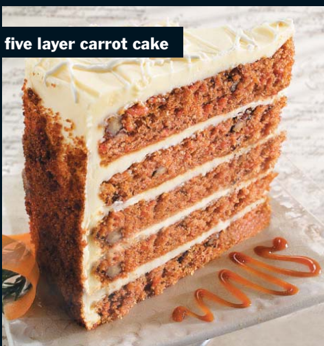
five layer carrot cake