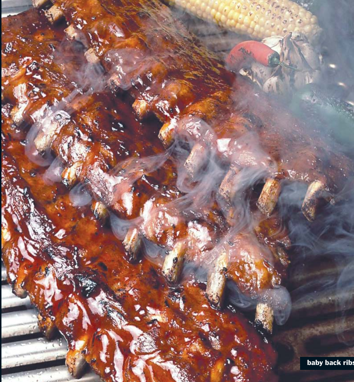
baby back ribs