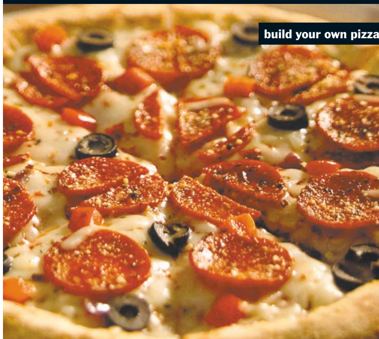
build your own pizza

Barbecue Sauce, Buffalo Sauce, Ranch or Baja Ranch