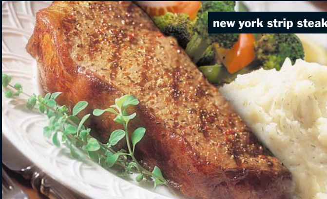
new york strip steak

Substitute a side choice for a loaded baked potato or mashed potatoes. Topped with bacon, sour cream and cheese ~ 1.49