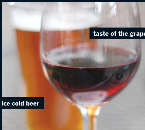
taste of the grape