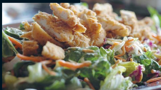
chinateown chicken salad