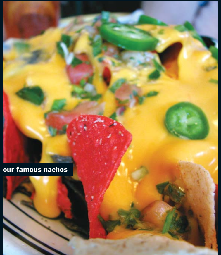
our famous nachos