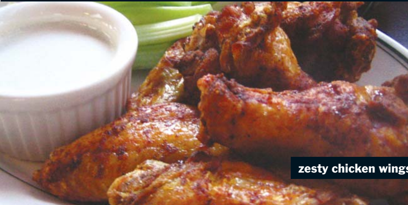
zesty chicken wings