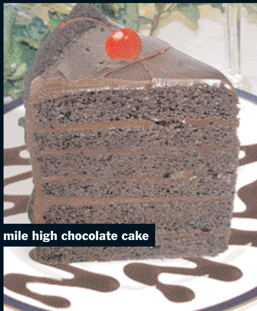
mile high chocolate cake

Taste this rich, dark, moist cake and you'll agree it's chocolate nirvana ~ 11.99 Add a scoop of ice cream to make it even better ~ 1.99